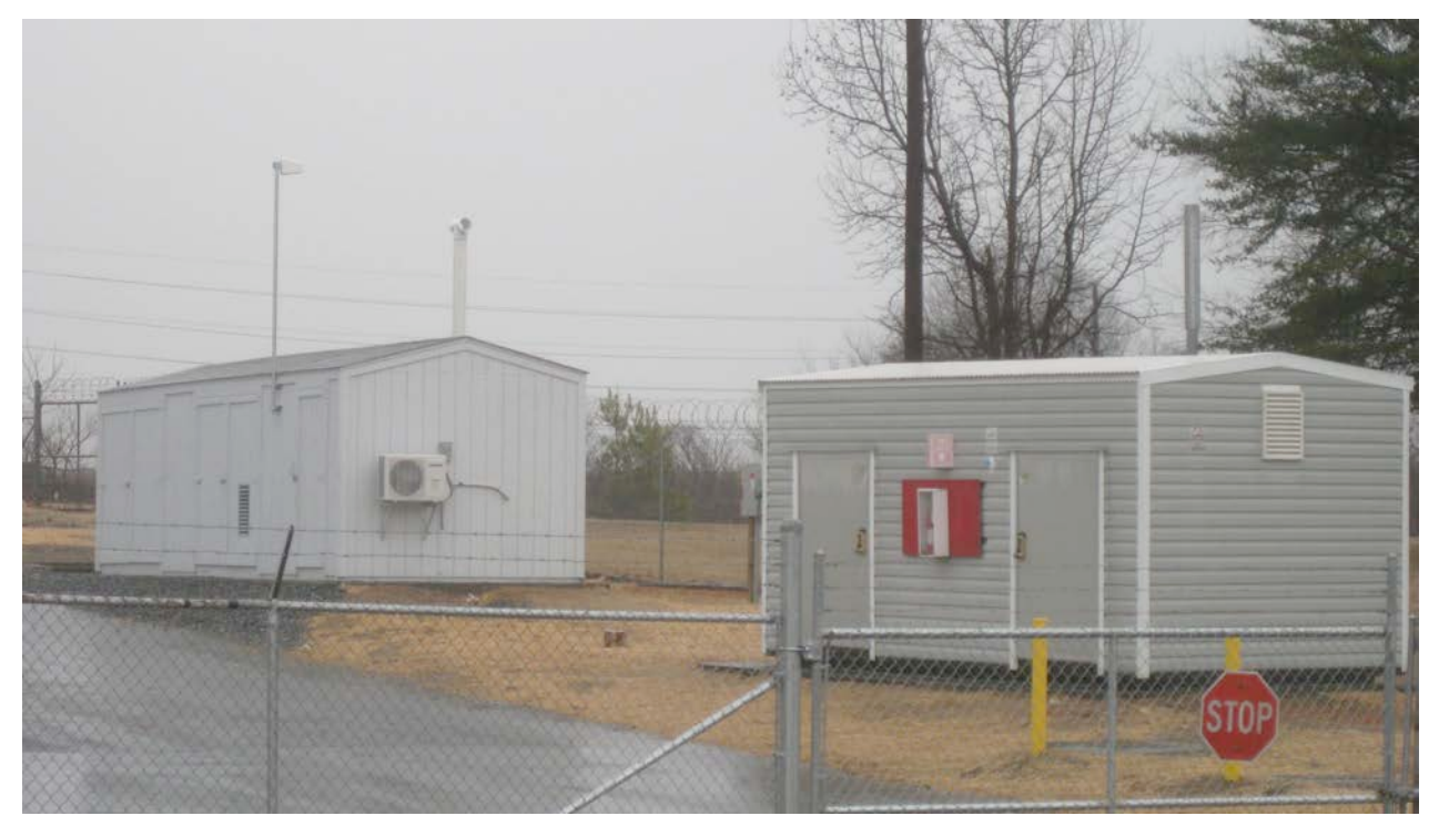
Treatment Systems on Kaba-Ilco Property

In 2000, Kaba-Ilco launched a soil vapor extraction system in the plant's courtyard area, near what it believed to be the principal source of PCE, a decommissioned, 150,000-gallon concrete-lined cooling basin. Though operation was suspended from 2008 to 2010, the system removed nearly 17,000 pounds of contaminant by December 2013. In 2008 the company started up a second treatment system, combining air sparging with soil vapor extraction on the property's southern boundary. By the end of 2013 this system had removed about 300 pounds of PCE.