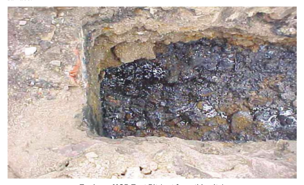
Tar in an MGP Test Pit (not from this site)

It should be pointed out that there have been many locations where MGP wastes have been haphazardly dumped at and around MGP facilities. We have no evidence that this occurred here, but it is important to keep this possibility in mind when preparing to remove some of those wastes. Both the tar and the tar-water mixture may come to the surface.