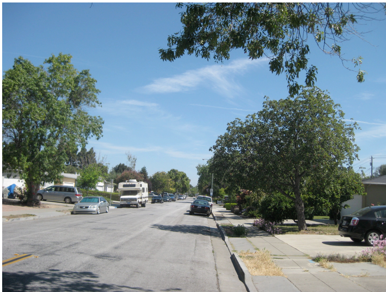
San Miguel neighborhood

As of October 2015, EPA has sampled 101 homes, finding unacceptable TCE levels in one single-family home and two duplexes (four homes). It is seeking permission to sample the rest of the 414 homes above the plume, and it “is engaging with property owners that have refused to allow testing despite tenants eager for sampling.”