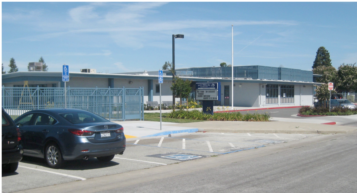
San Miguel School

Ironically, the Bay Area Regional Water Quality Control Board, supported by EPA, conducted one of Silicon Valley's first vapor intrusion investigations at this site, back in 1991. Despite modeling showing excess lifetime cancer risks to the neighborhood on the order of one in 10,000, it concluded on the basis of soil vapor sampling, conducted with flux chambers, that the risk was less than the one in a million. The Board and the companies moved forward with groundwater cleanup, but not until late 2013, when U.S. EPA sent a letter to the Water Board requesting that it re-open investigations at several Silicon Valley Superfund sites, did the vapor intrusion issue rise to the surface again.