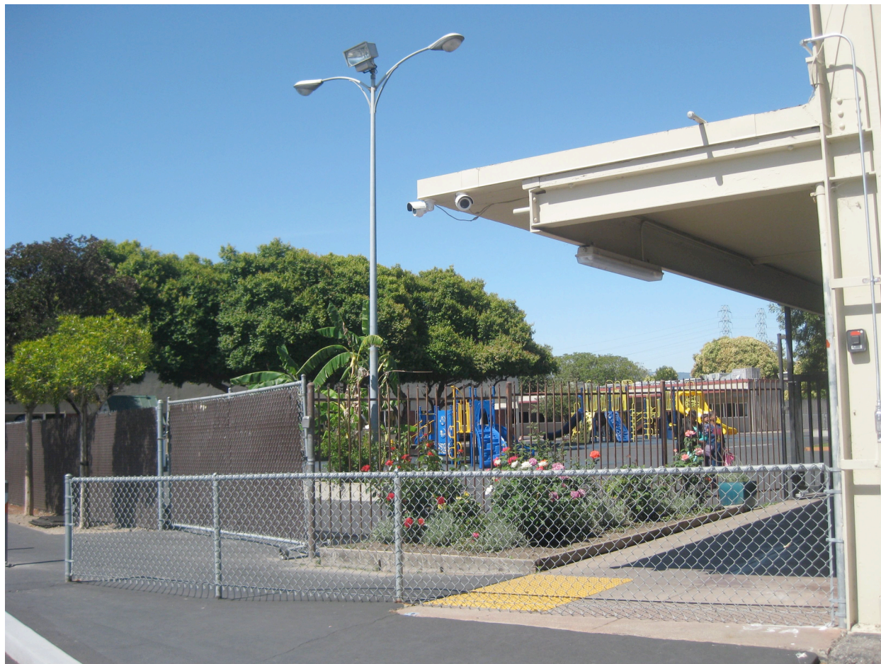
Rainbow Montessori School

Pump-and-treat continued unabated, and the vapor intrusion investigation was proceeding slowly. Under Water Board direction, Philips' consultant had conducted soil vapor sampling at the Rainbow Montessori portion of the Sunnyvale High School site in February 2004. Indoor air sampling found elevated TCE inside one building, but improved ventilation brought the level down.