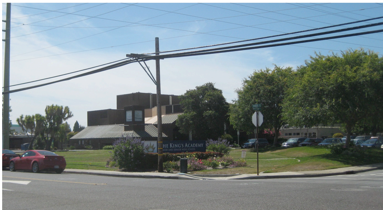
King's Academy on the former Sunnyvale High School site

The Regional Water Board issued a joint cleanup and abatement order to all three companies in June, 1984. Reportedly this was only the second such order the Board issued for underground tank-leak contamination. The Water Board identified an operable unit for each source area, and it established the Offsite Operable Unit covering about 100 acres to the North, downgradient from the factories, where at the time TCE in groundwater exceeded 5 parts per billion (ppb). The offsite area also included the former campus of Sunnyvale High School, closed in 1981, used then as a research and development facility by Westinghouse. It also contained San Miguel School, at the time serving as a day care center.